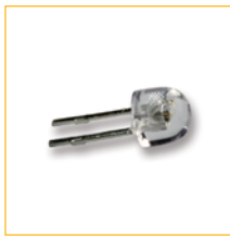
2. Single Coloured LED "Spark"