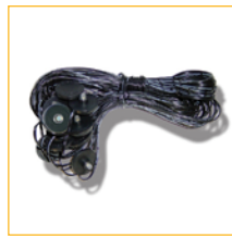
3. LED Strings