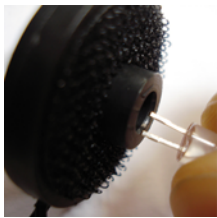
1. LED Socket