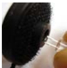
1. LED Socket