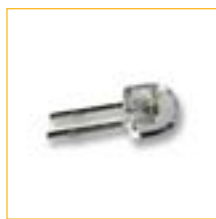
2. Single Coloured LED "Spark"