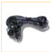
3. LED Strings