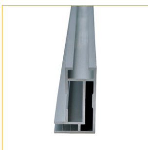
1. Single Frame Profile