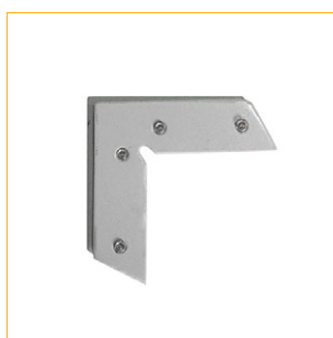
2. Corner Connector Set