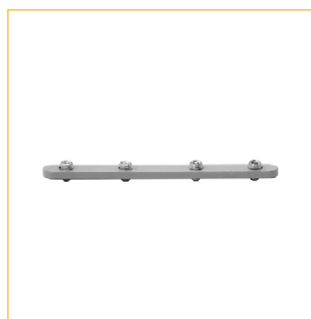
3. Connection Plate