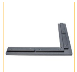
10. Frame Corner connector HD