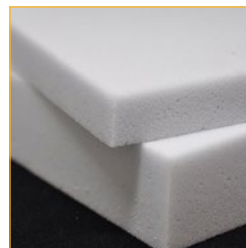
13b. Melamine Foam