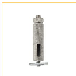
11. Cable Glider