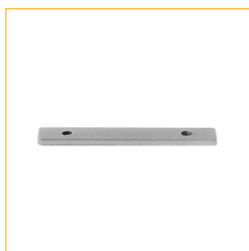
7. Brace Join Plate