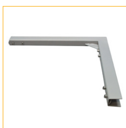
3. Reinforced corner