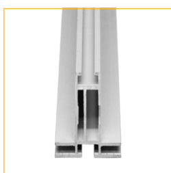
1. Double Print Frame