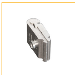
6. Brace Lock