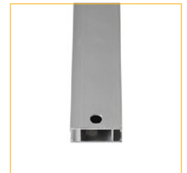
5. Brace Profile