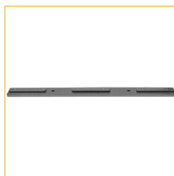
9. Frame Joiner Set HD