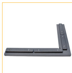
10. Frame Corner connector HD