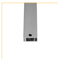
5. Brace Profile