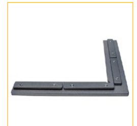
10. Frame Corner connector HD