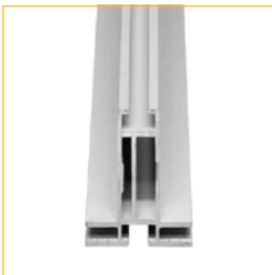
1. Double Print Frame