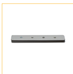
4. Joiner Set