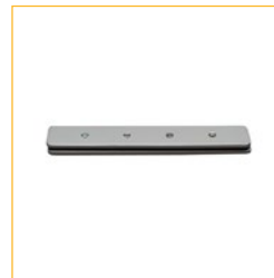
4. Joiner Set