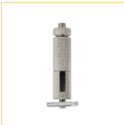
11. Cable Glider