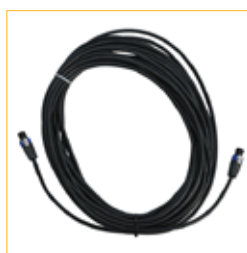
4. Link Cable