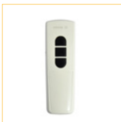
8. RF Remote Control