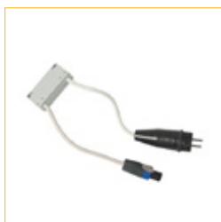
7. RF Receiver