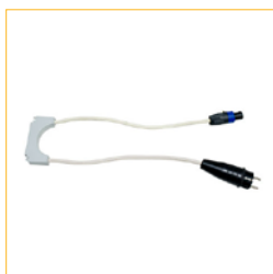
7. RF Receiver