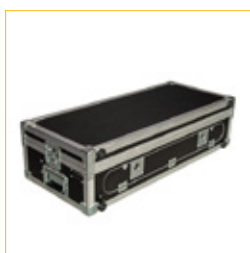
1. Flight Case