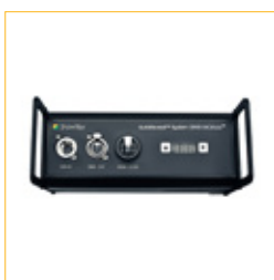
3. AutoReveal System DMX Basic Module