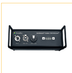
3. AutoReveal System DMX Basic Module