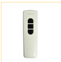
8. RF Remote Control