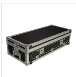
1. Flight Case