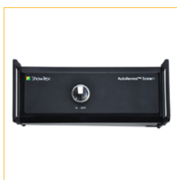
2. Remote Control