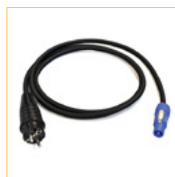
5. Power Cable