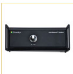
2. Remote Control