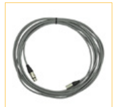
Emergency Stop Extension Cable