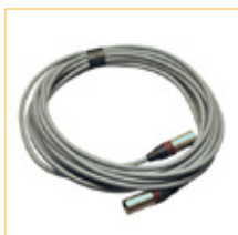
Emergency Stop Link Cable