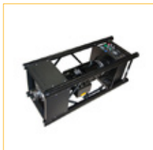
HiSpeed Motor 8000