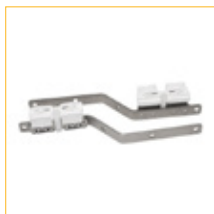
09. Overlap Carrier Set