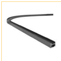
02. Curved Track 90°