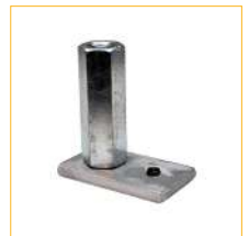
06. Ceiling bracket M10