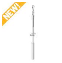
10. Rod for Manual Control