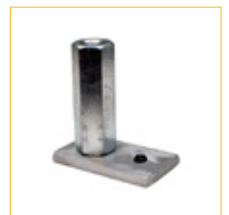
06. Ceiling bracket M10