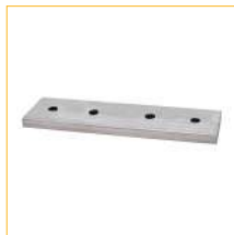
03. Joiner Plate