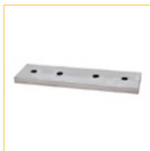
03. Joiner Plate