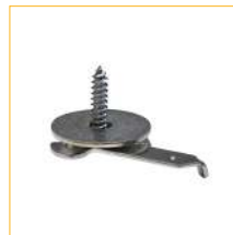
05. Hidden Ceiling Bracket