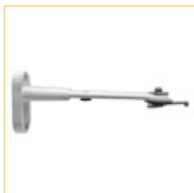
07. Wall Bracket