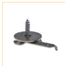
05. Hidden Ceiling Bracket