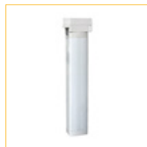
10. Rope Track Drive 400