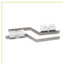
09. Overlap Carrier Set