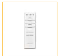
11. Remote Control