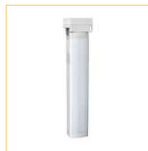
10. Rope Track Drive 400