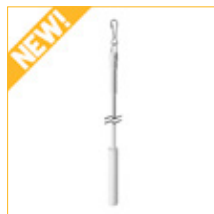
10. Rod for Manual Control