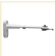
07. Wall Bracket