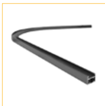
02. Curved Track 90°