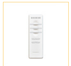
11. Remote Control